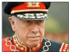
General Pinochet in Chile (1980's): Powerful dictator at the head of an oligarchic group.